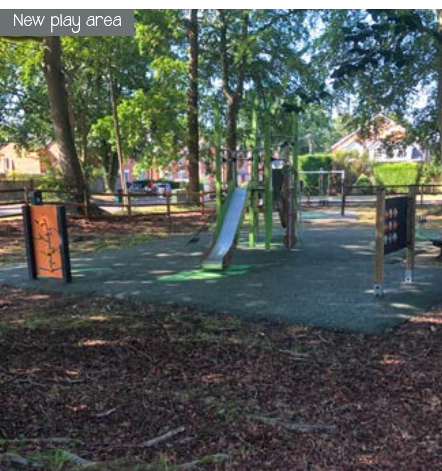
New play area