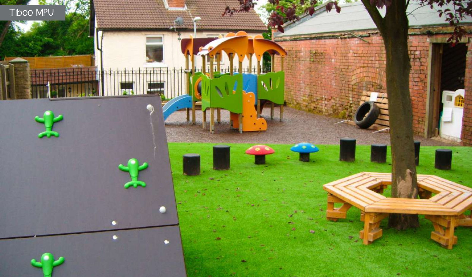
Play Panel - Chimes